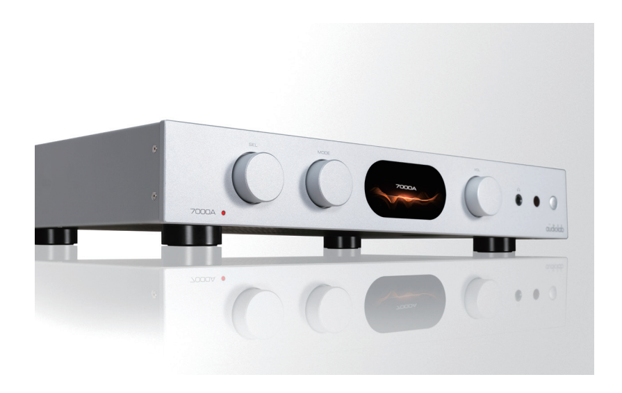
Left Whether its powering speakers or headphones, the 7000A is expertly engineered to make the most of all manner of music

The 6000A delivers 50W per channel into 8 ohms; the 7000A ramps this up to 70W, with a maximum current delivery of 9 Amps into difficult loads. The output stage of the discrete power amp circuits uses a CFB (Complementary Feedback) topology, ensuring superior linearity and excellent thermal stability, as the idle current is kept independent of the temperature of the output transistors. The 6000A's 200VA toroidal transformer has been uprated to a new 250VA unit, combining with 60000uF reservoir capacitance to maintain firm control of the music whilst enabling excellent dynamic range.