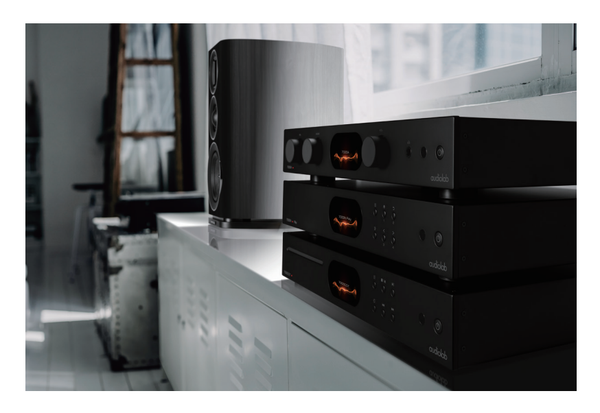
Left All three 7000 Series components are available in classic Audiolab black as well as silver

Finally, 'Pre Mode' disables the power amp stage, turning the 7000A into a standalone DAC/preamp. This enables external power amplification to be added, thus providing a possible upgrade path.