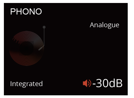
Left The 7000A's GUI, displayed on its 2.8in colour screen, gives access to settings, format data, and even a VU meter display in 'analogue' or 'digital'