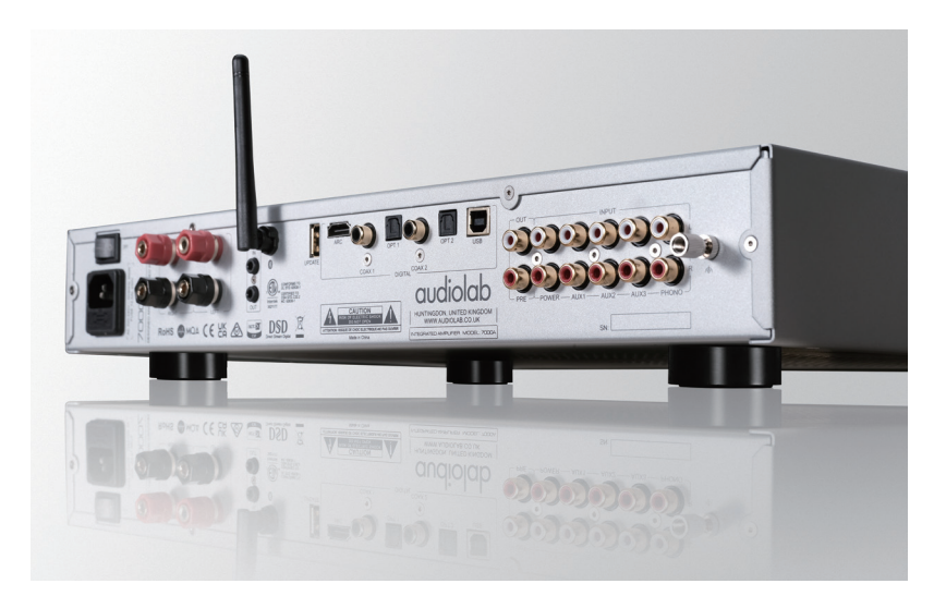
Left The 7000A's USB, HDMI, optical and coaxial digital inputs benefit from the amp's state-of-the-art built-in DAC

No company knows more about making the most of Sabre DAC technology than Audiolab, having worked with it for years through several product generations. Although always technically excellent, these DAC chips are also challenging to implement to maximum effect and must be integrated into a product's circuit design with care to extract their full sonic potential. The post-DAC active filter is a critical element; Audiolab developed a new Class A circuit for its flagship 9000A integrated amp that's perfectly tailored to make the most of the ES9038 chip family and this same circuit is used in the 7000A .